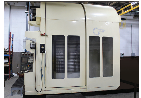
Campbell CNC 3-Axis Vertical ID Grinder

We ensure your industrial hard chrome parts meet precise thicknesses externally – as well as grinding the inside diameter of a part's cylindrical opening to the exact size and surface finish to meet your needs. Techmetals can grind many materials besides hard chrome, including some exotic materials.