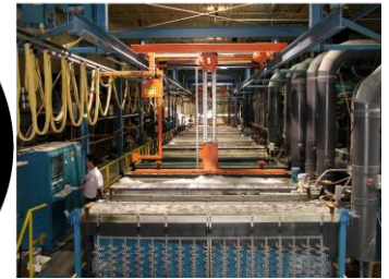
High Production on Automatics for Consistent results

Our Engineered Coatings: (Learn more @ www.techmetals.com )