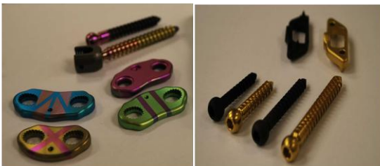
MedaDize & Titanium Anodize

TM 103, TM 105, TM 109, TM 111, TM 117C, TM 117P, TM 129, TM 329, TM 133, Diamonize, E-Krome, UltraKoat, OptaKoat, Invinc-Alloy, TM-Xcalibur, Armatech, OxyTech, OxyLube, OxyTech V, OxyTech X, TM-Rx, MedaDize, BioBrite, MedaPass, and others. Visit our website at www.techmetals.com to learn more!